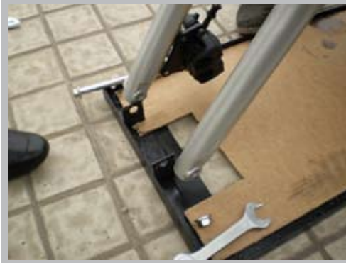
Remove the nut from the axle attached to the shipping crate using wrench (17mm x19mm)