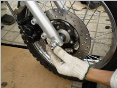
Slide front axle through the fork, spacers and wheels. Screw nut onto the end of the axle. (Torque rating: 55-65 Nm)