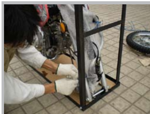
Remove all loose components from the metal crate.