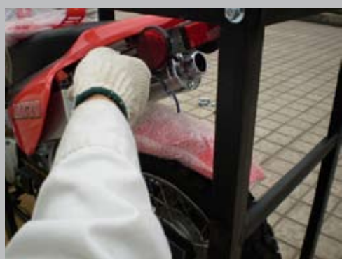
Release the rear fender tied to the rear of the bike.