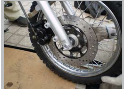
Place front wheel into position between the forks. Ensure that disc slides between caliper.