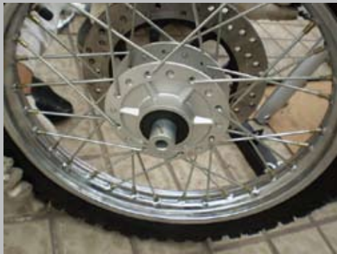
Install the smaller spacer on the left side (side without disc).