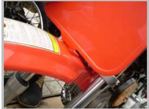
Install the No.plate, which was packed on the seat.