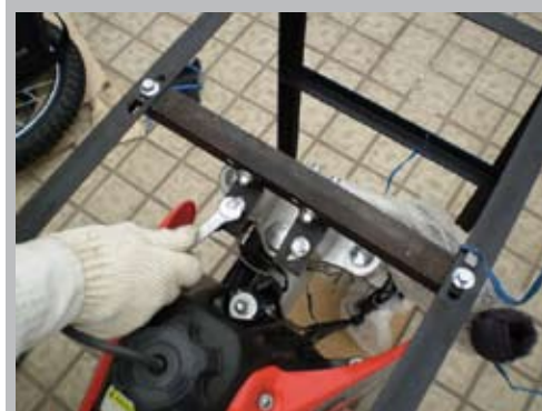
Remove the two bolts from the metal crate attached to the handle bar clamp using a 10mm wrench.