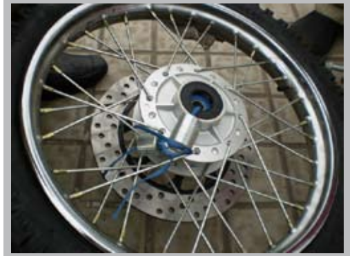
Release spacers attached to front wheels. Notice the different lengths of the two spacers.