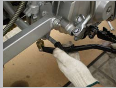
Slide the rear rear brake lever onto the rod and position in place.