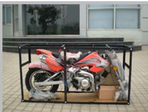
Remove Carton and vinyl wrap from metal crate.