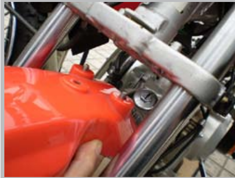
Install the rear two screws to fix the front fender at first.