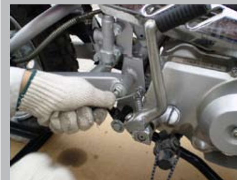
Install the spring using a flat headed screwdriver. Start by connecting the lower side of the spring first.