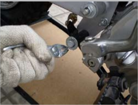
Split the cotter pin with each are on opposing sides.