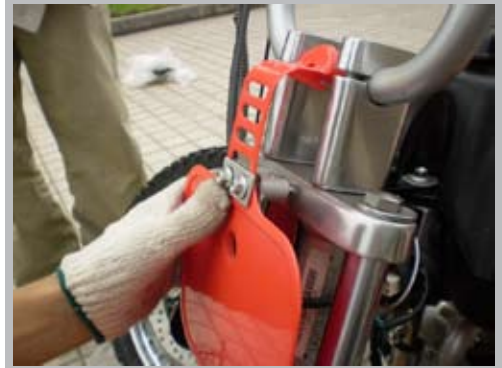
Fasten number plate to the triple tree clamp using the two screws.