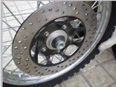
Install the larger spacer on the right side (side with disc).