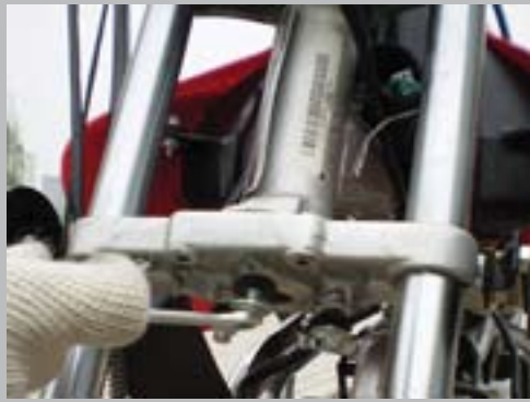
Loosen the 3 screws for front fender from the steerer column.