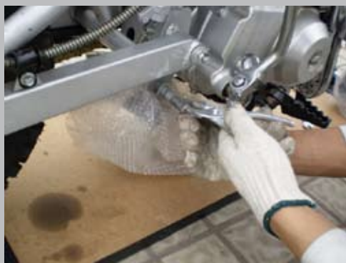
Remove the cotter pin for the brake lever using pliers. Slide off the washer.