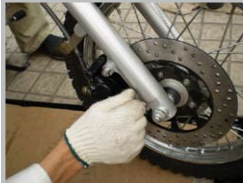
Tighten bolts on front caliper.