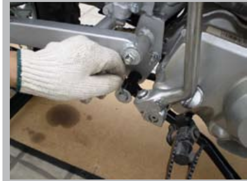
Re-install the washer and cotter pin.