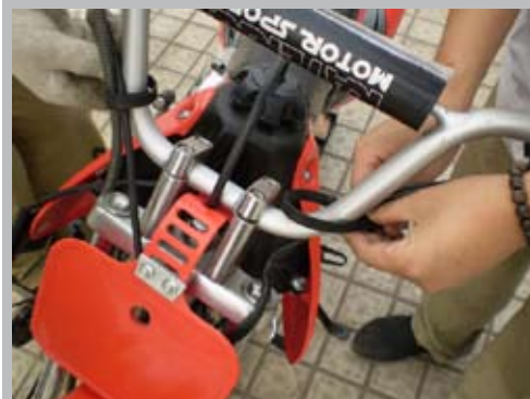
Tie straps around cables to the handle bar.