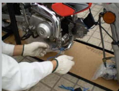
Release the rear brake lever tied to the exhaust.