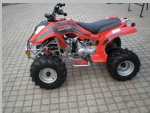
Re-install the seat. Assembly is complete.