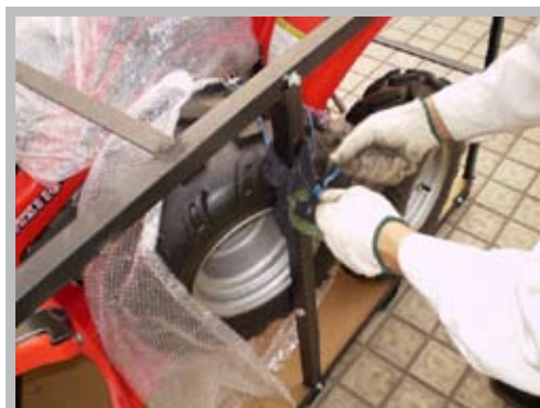
Remove all loose components from the metal crate.