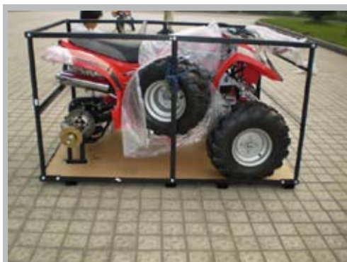
Remove Carton and vinyl wrap from metal crate.