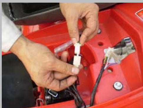
Connect the cable.