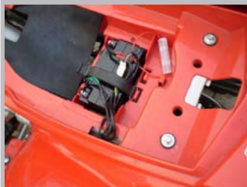
Fix the battery and cables with the provided rubber strap.