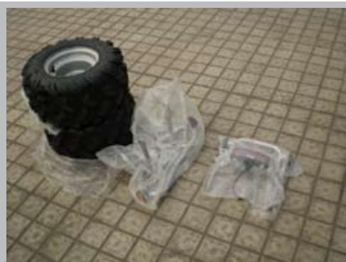
Two tires, front bumper and carry bar will be attached to main crate