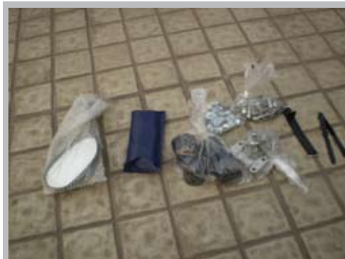
Accessories from carton box: 1x rear view mirror; 1x tool bag; 4x dirt-proof cap; 2x handlebar securing blocks; 3x bags of bolts, nuts and fasteners