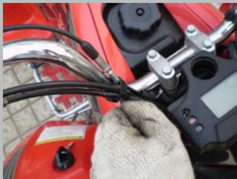
Fasten the cables with fastener. (Right)