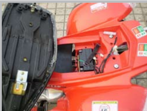
Remove the seat.