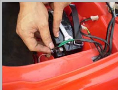
Connect the battery. Green cable plugs to negative terminal.