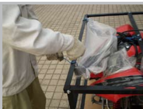
Remove the fastener tied to loose parts from the metal frame.