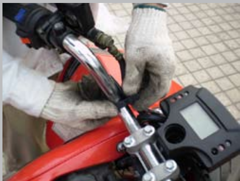
Fasten the cables with fastener. (left)