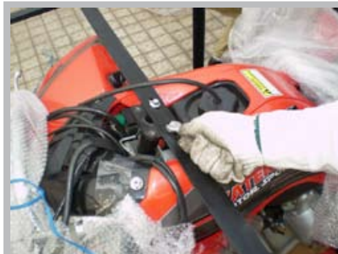
Remove the two bolts from the metal crate attached to the handle bar clamp using a 10mm wrench.