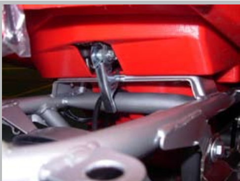
Remove the seat by pulling the seat lock towards the back of the ATV.